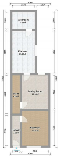
Warwards Lane Ground Floor