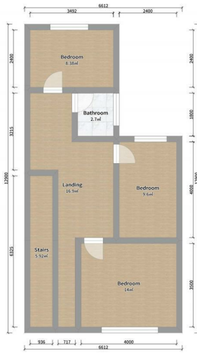
Warwards Lane First Floor